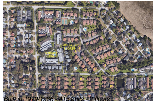
Built in 1979/1986 - 415 units - 2 floors