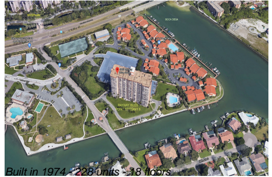
Built in 1974 - 228 units - 18 floors

Number of units: 228 Number of active listings for rent: 0 Number of active listings for sale: 17 Building inventory for sale: 7% Number of sales over the last 12 months: 18 Number of sales over the last 6 months: 7 Number of sales over the last 3 months: 6