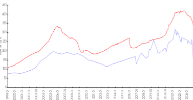
Bayway Isles Point Brittany 5 vs St Petersburg