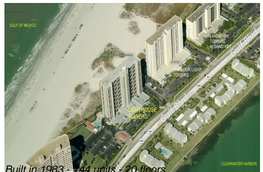
Built in 1983 - 144 units - 20 floors