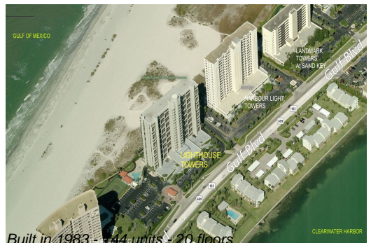
Built in 1983 - 144 units - 20 floors