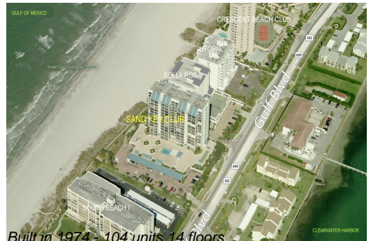
Built in 1974 - 104 units, 14 floors