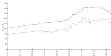
Shores of Long Bayou vs St Petersburg