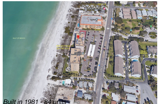
Built in 1981 - 84 units