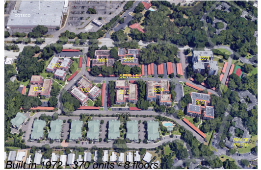
Built in 1972 - 370 units - 8 floors

Number of units: 370 Number of active listings for rent: 0 Number of active listings for sale: 25 Building inventory for sale: 6% Number of sales over the last 12 months: 16 Number of sales over the last 6 months: 9 Number of sales over the last 3 months: 2