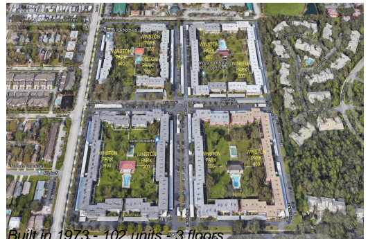
Built in 1973 - 102 units - 3 floors