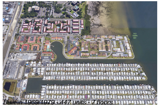
Built in 1969/1979 - 447 units - 7 floors