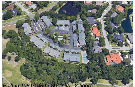
Built in 1981/1984 - 80 units - 2 floors