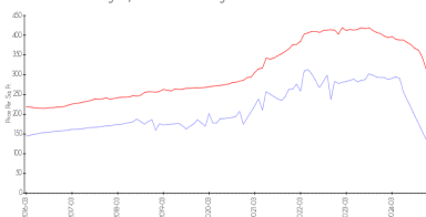
Shores of Long Bayou vs St Petersburg