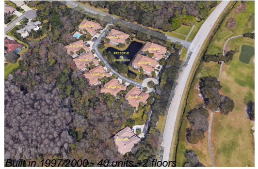
Built in 1997/2000 - 40 units - 2 floors

MLS Number: U8233906 Status: ACTIVE Size: 2,295 Sq ft. Bedrooms: 3 Full Bathrooms: 3 Half Bathrooms: 0 Parking Spaces: View: Trees/Woods List Price: $535,000 List PPSF: $233