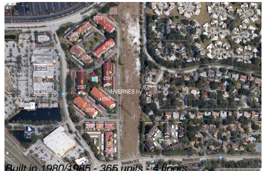
Built in 1980/1985 - 365 units - 4 floors