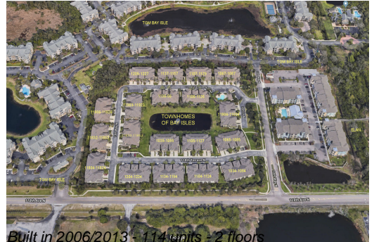
Built in 2006/2013 - 114 units - 2 floors

Number of units: 114 Number of active listings for rent: 0 Number of active listings for sale: 2 Building inventory for sale: 1% Number of sales over the last 12 months: 6 Number of sales over the last 6 months: 4 Number of sales over the last 3 months: 1