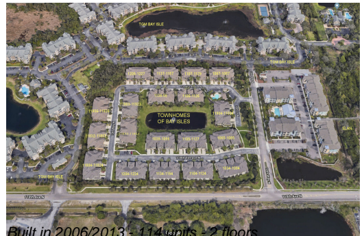
Built in 2006/2013 - 114 units - 2 floors