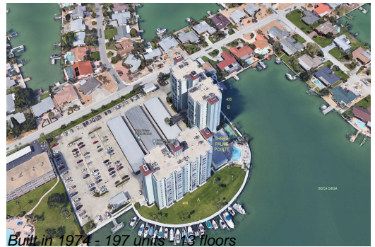
Built in 1974 - 197 units - 13 floors

The above valuated price is a baseline figure that does not take into account any specific renovation, upgrade, split, merge, or deterioration of the unit.