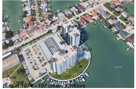
Built in 1974 - 197 units - 13 floors

400 64th Ave # 202 - 400 64 Ave, St Pete Beach, FL, Pinellas 33706