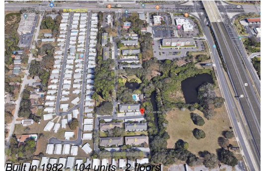
Built in 1982 - 104 units - 2 floors