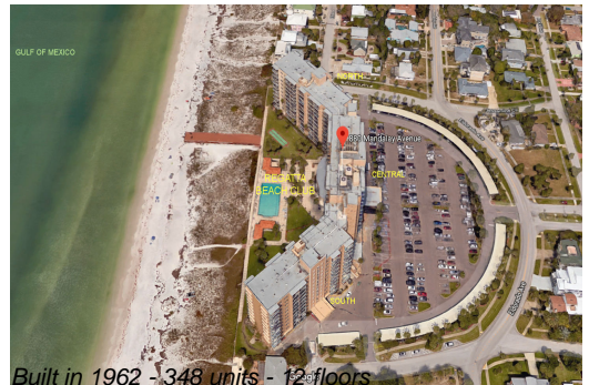
Built in 1962 - 348 units - 12 floors