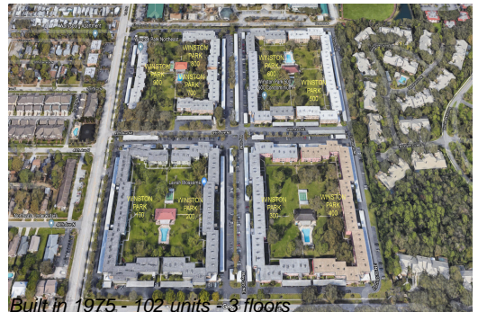
Built in 1975 - 102 units - 3 floors