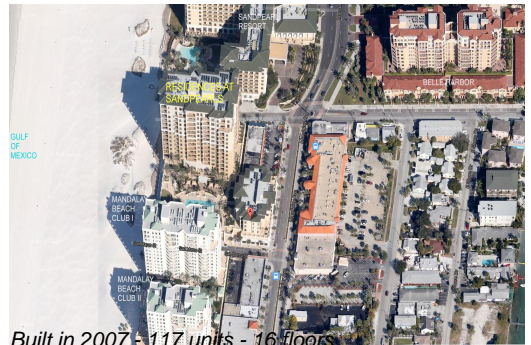
Built in 2007 - 117 units - 16 floors