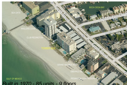
Built in 1970 - 85 units - 9 floors