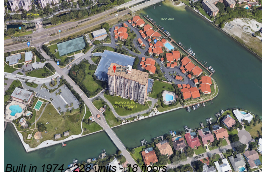
Built in 1974 - 228 units - 18 floors