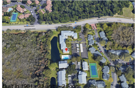
Built in 1981 - 33 units - 3 floors

Number of units: 33 Number of active listings for rent: 0 Number of active listings for sale: 0 Building inventory for sale: 0% Number of sales over the last 12 months: 2 Number of sales over the last 6 months: 0 Number of sales over the last 3 months: 0