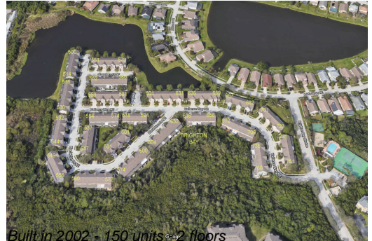
Built in 2002 - 150 units - 2 floors