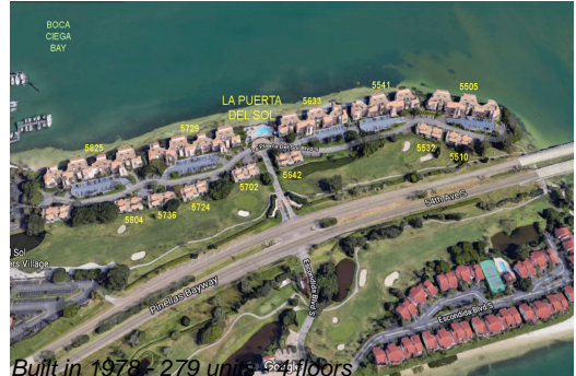
Built in 1978 - 279 units - 6-10 floors