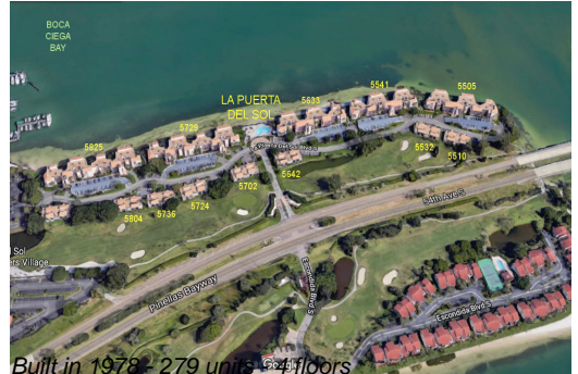
Built in 1978 - 279 units - 4 floors