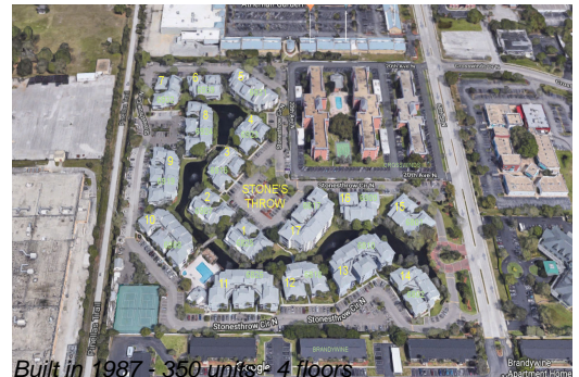
Built in 1987 - 350 units - 4 floors