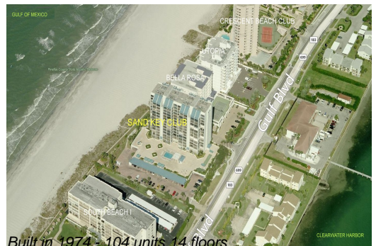
Built in 1974 - 104 units, 14 floors