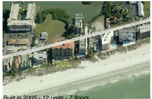
Built in 2005 - 12 units - 7 floors