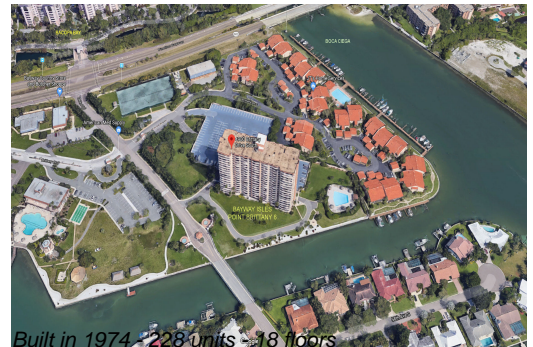
Built in 1974 - 228 units - 18 floors