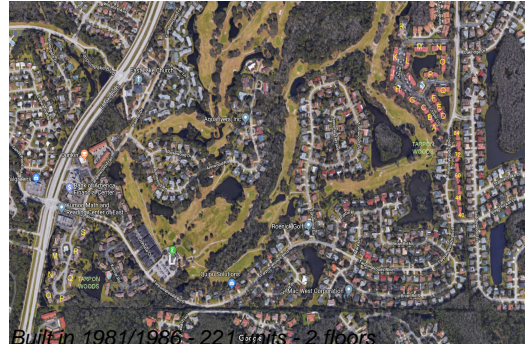
Built in 1981/1986 - 221 Units - 2 floors