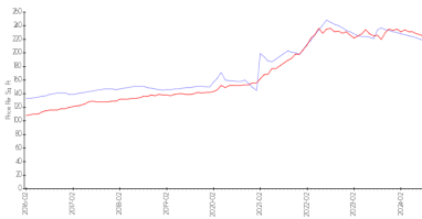
Tarpon Ridge Townhomes vs Palm Harbor