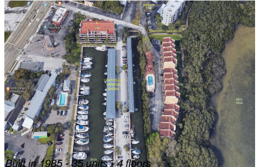
Built in 1985 - 35 units, 4 floors