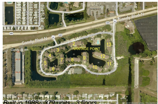
Built in 1988 - 379 units - 3 floors