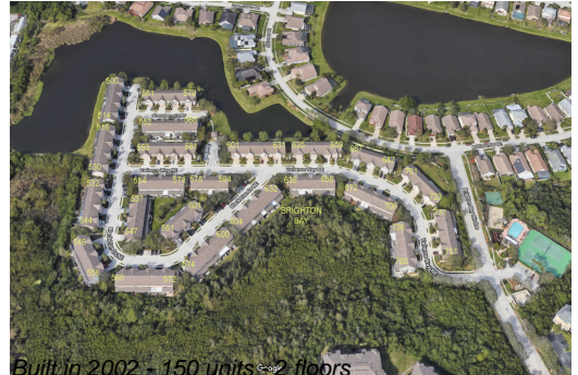
Built in 2002 - 150 units < 2 floors