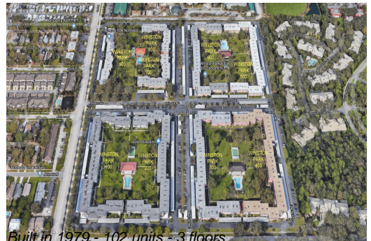
Built in 1979 - 102 units - 3 floors