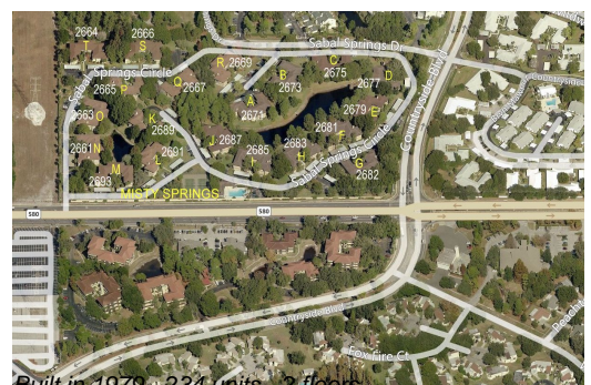
Built in 1979 - 234 units - 2 floors