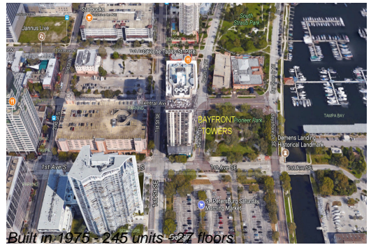
Built in 1976 - 245 units - 627 floors