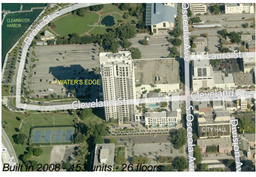
Built in 2008 - 153 units - 26 floors