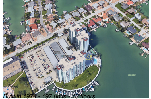
Built in 1974 - 197 units - 13 floors