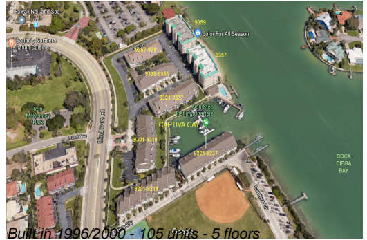
Built in 1996/2000 - 105 units - 5 floors