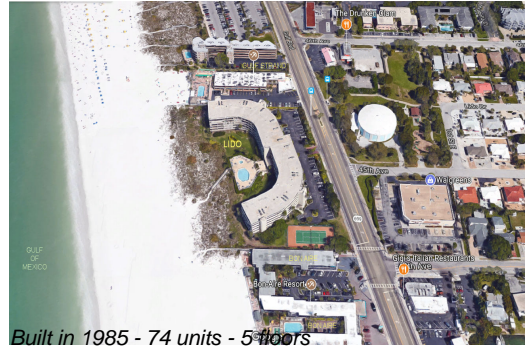
Built in 1985 - 74 units - 5 floors