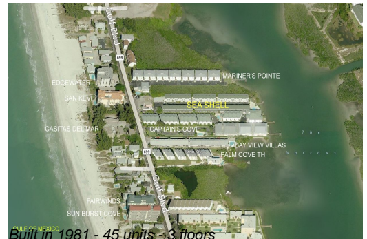
Built in 1981 - 45 units - 3 floors