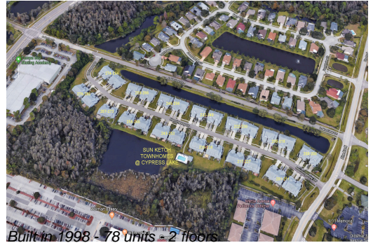
Built in 1998 - 78 units - 2 floors