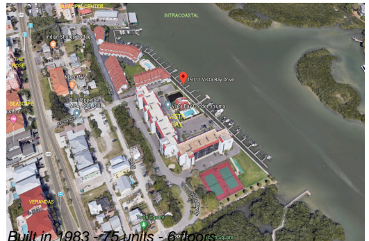
Built in 1983 - 75 units - 6 floors