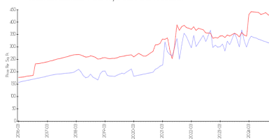
Belleview Biltmore Villas Bayshore I & II vs Belleair