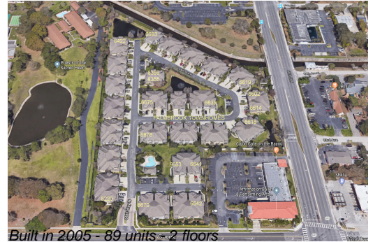
Built in 2005 - 89 units - 2 floors

The above valuated price is a baseline figure that does not take into account any specific renovation, upgrade, split, merge, or deterioration of the unit.