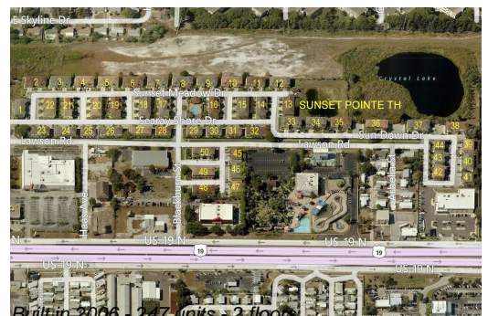
Built in 2006 - 247 units - 2 floors